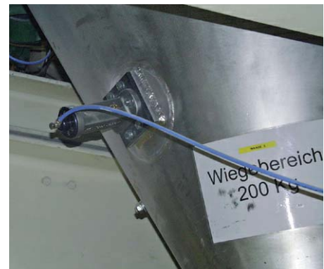
Cleaning weighing containers