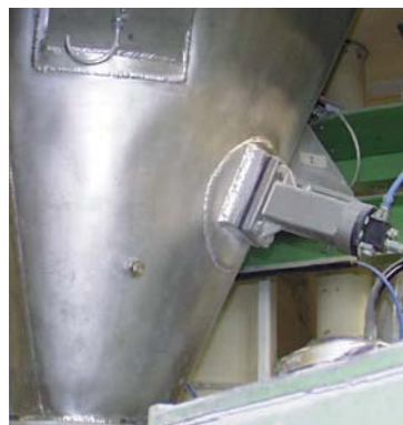
Cleaning bunker walls